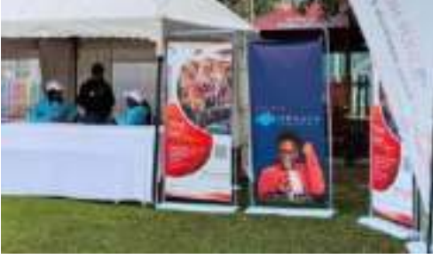
(Sponsors/Vendors at the event)