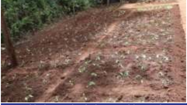
UKC kitchen & herbal vegetable garden