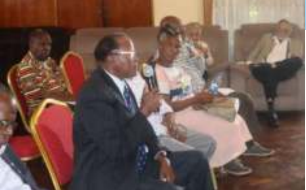
(Hon. Life members listening on at a luncheon meeting organized by UKC management)