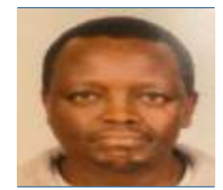
Member number 3142