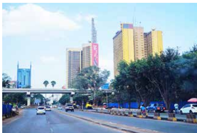
Teleposta Towers in Nairobi, Kenya