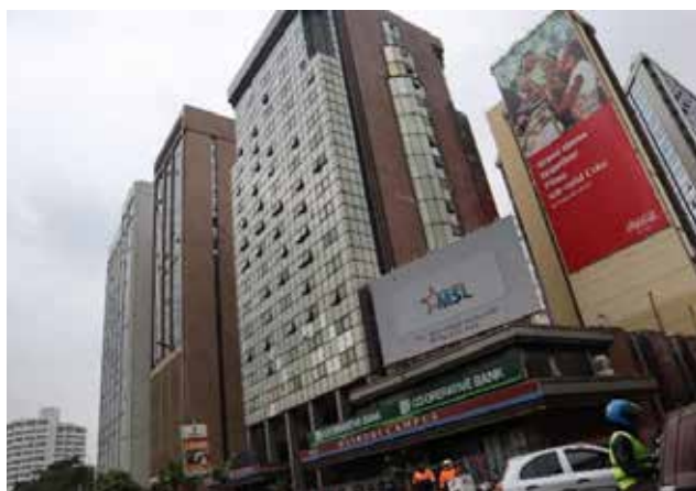
Anniversary/ Kemu / View Park Towers

The power of futuristic planning brings out the potential of a place with a UKC sky scrapper a parking silo, Club offices, conference rooms, accommodation rooms, a coffee Centre and a sports bar with variety of sports for bringing unity in diversity more in the United Kenya Club.