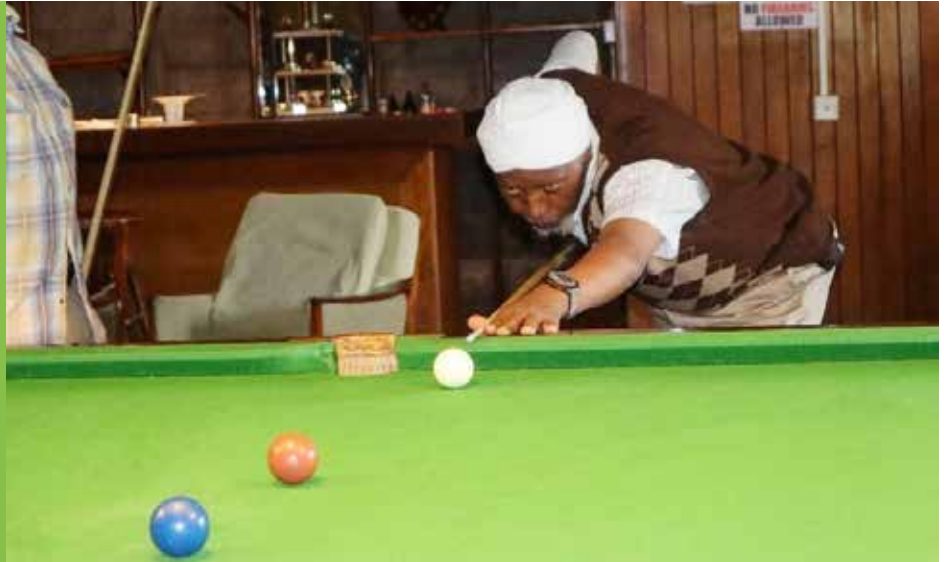
"The United Kenya Club National Snooker tournament"

The Clubs 77th anniversary fall on Sunday 29th October 2023. The snooker lovers of The United Kenya Club will be facing other participating Clubs and individuals in a hot paced tournament dubbed "The United Kenya Club National Snooker tournament" This event will kick off on Friday 27th and the winner will be known on Sunday afternoon. Snooker game for all.